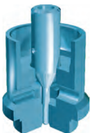
Micro-flow high pressure drop plug and seat construction with extra guiding