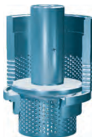
Double stage low noise / anti-cavitation trim design for severe service